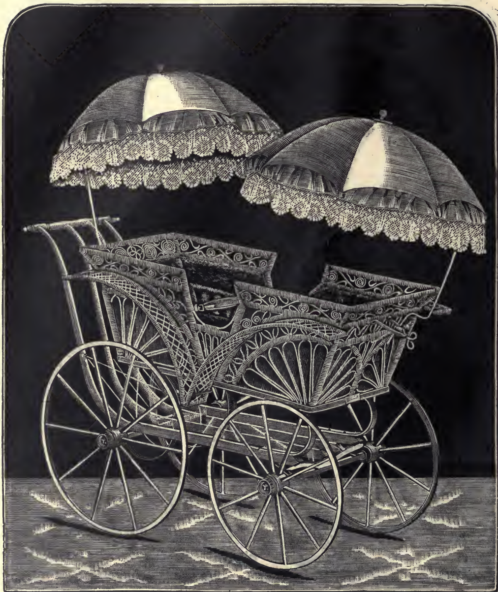
R 182 Reed, finished Light Cherry.

H GRADE. —Fine Quality Silk Plush. Special Gear. No. 4 Parasols, ——— $76 00