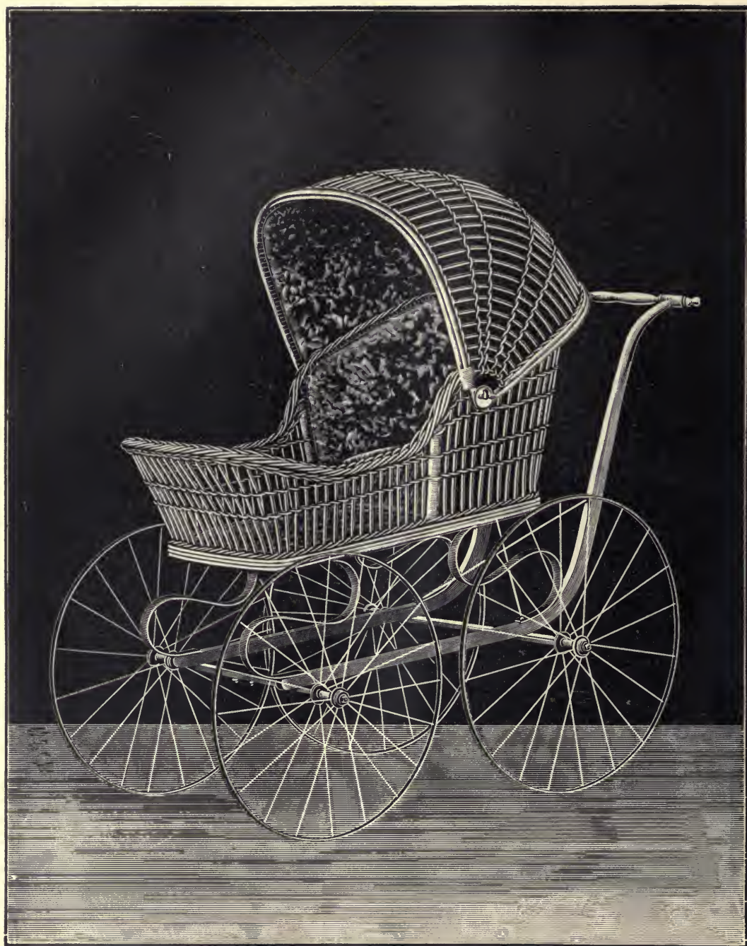
R 500 Reed finished Light Cherry.

E GRADE.—American Damask. S Gear, - - - - $16 00