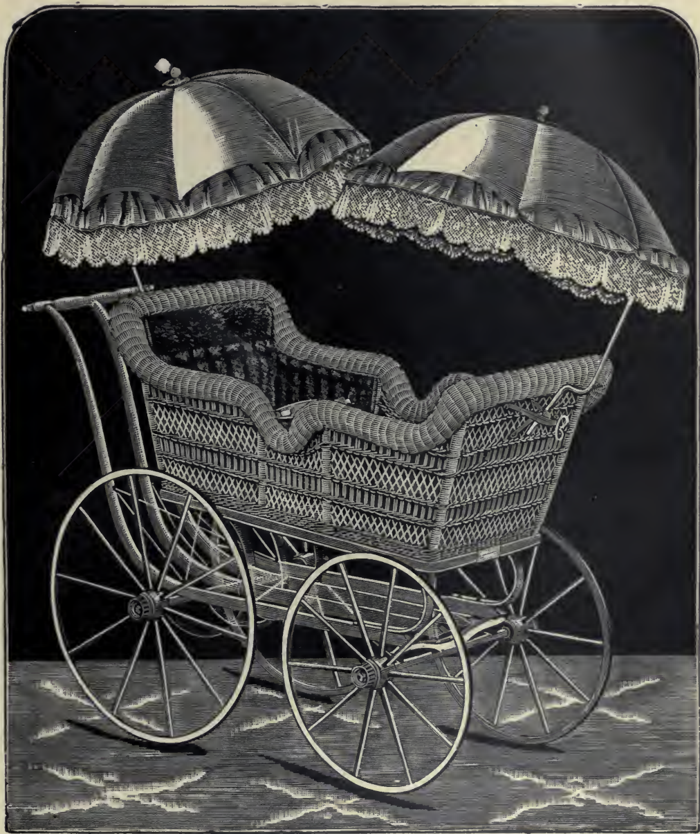
R 160 Reed, finished Light Cherry.

G P GRADE.—Silk Goods, with Plush Roll. Special Gear. No. 4 Parasols, $44 00