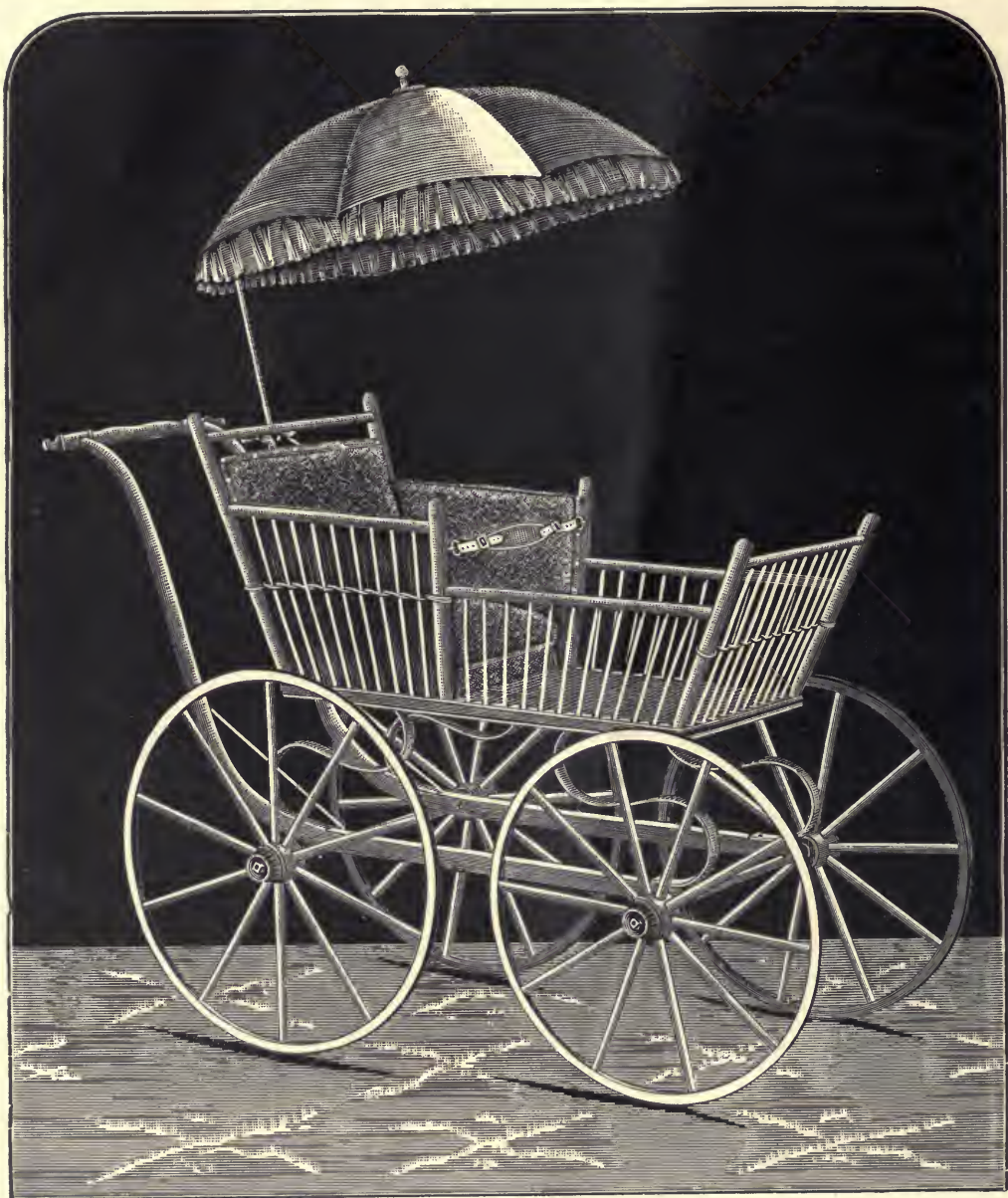
R 100 Reed, finished Light Cherry.

E GRADE.—American Damask or Cretonnes. S Gear. No. 1 Parasol, - $13 00