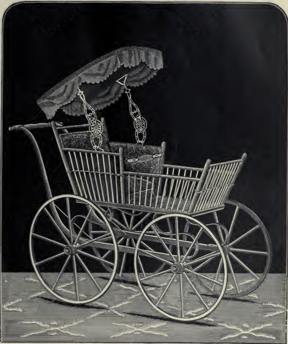
R 100½ Reed, finished Light Cherry.

E GRADE.—American Damask or Cretonnes. S Gear. A Canopy, $13 00