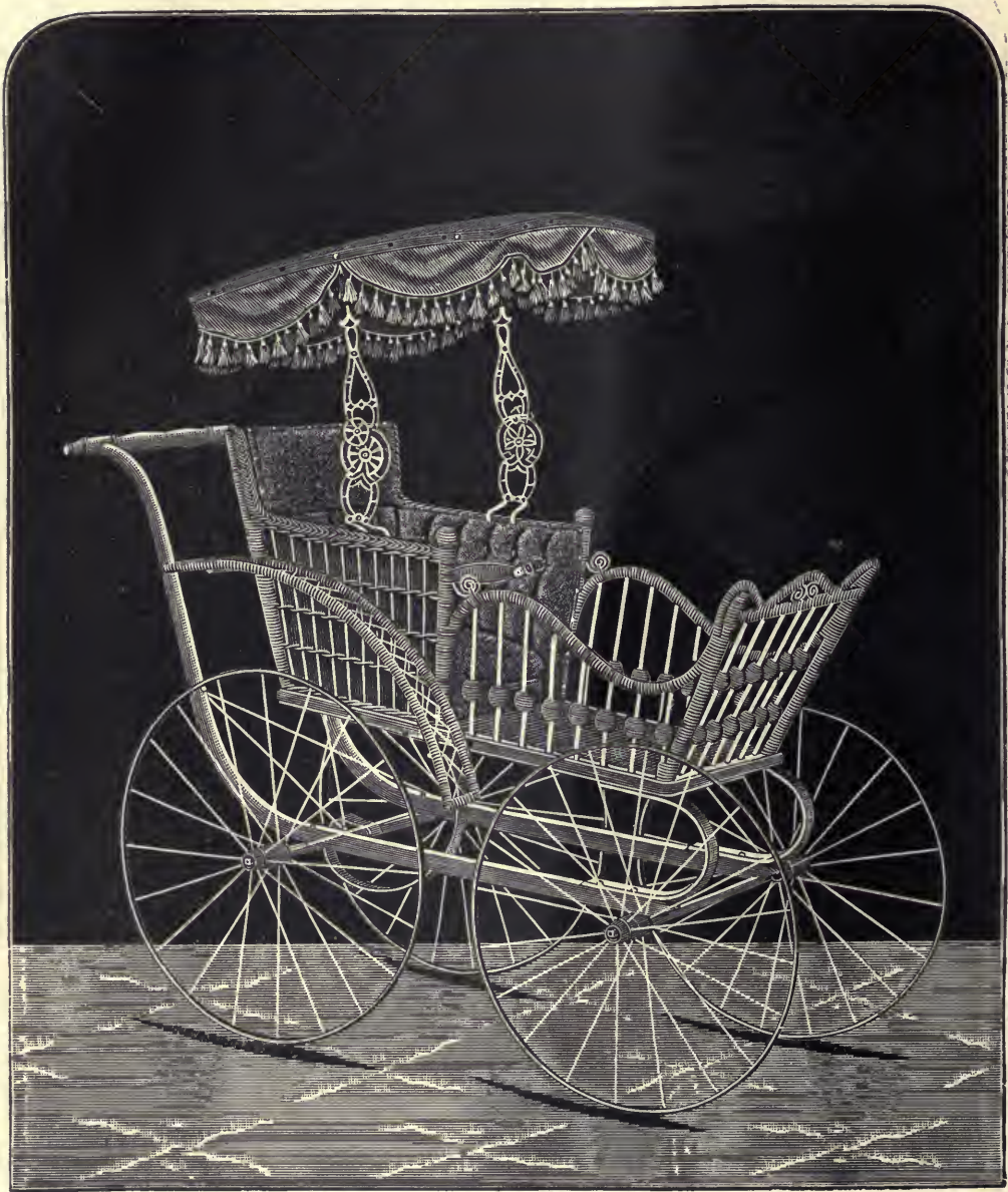
R 113½ Reed, finished Light Cherry.

E P GRADE. —American Damask, with Plush Roll. Globe Gear. A Canopy, $22 00 H “ —All Silk Plush, - - - - - 28 00