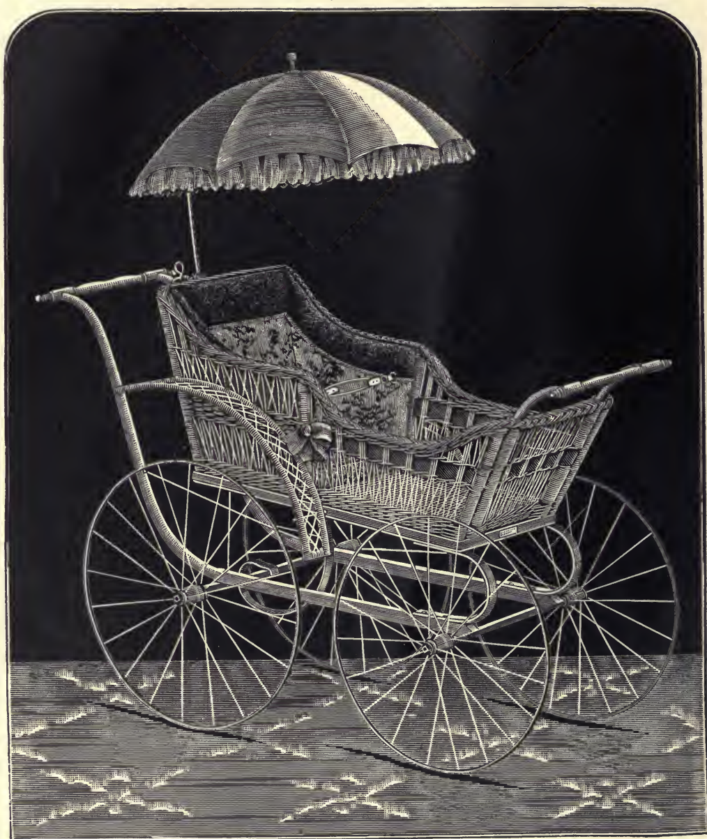
R 110 Reed, finished Light Cherry.