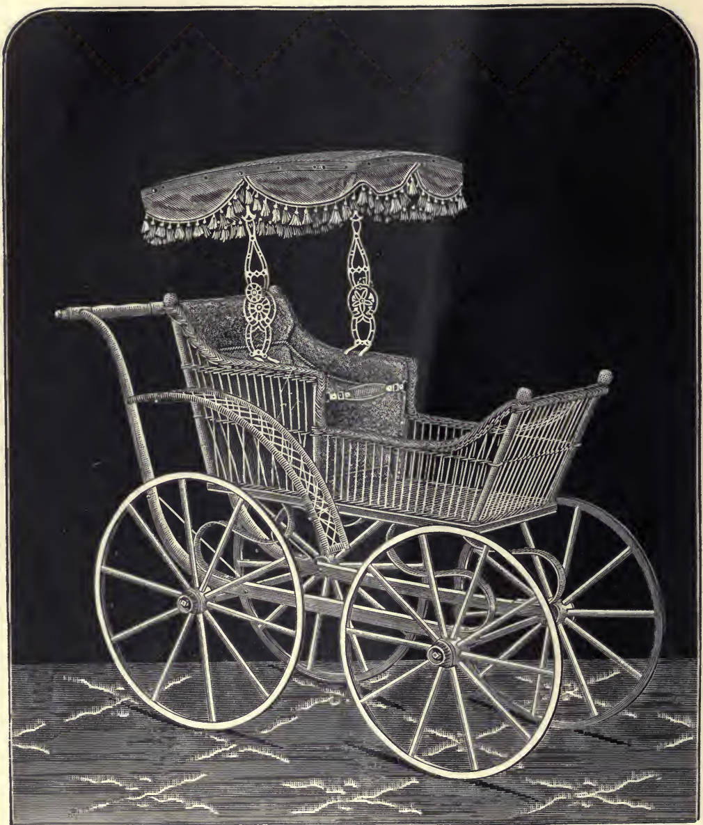
R 106½ Reed, finished Light Cherry.