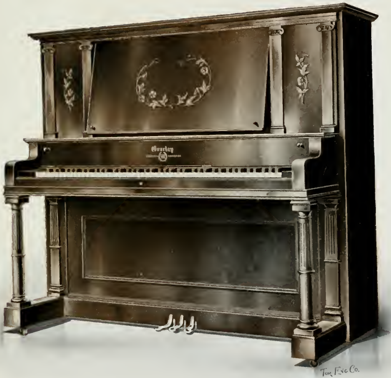
Style 7.—Ornate Colonial Design New Grand Scale