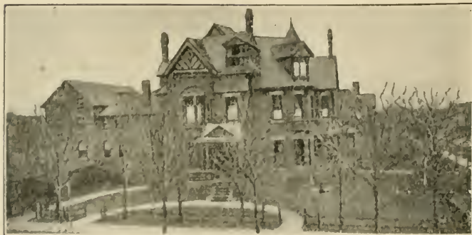
ST. MARGARET'S COLLEGE, TORONTO.