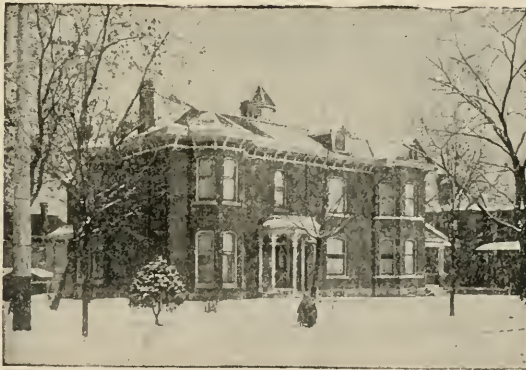
KINGSTHORPE COLLEGE, HAMILTON.