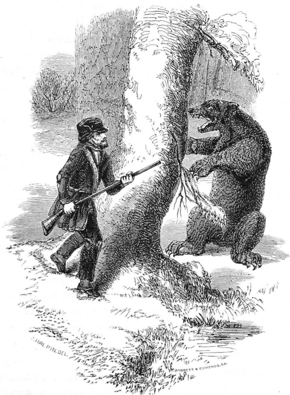
KILLING THE BEAR.