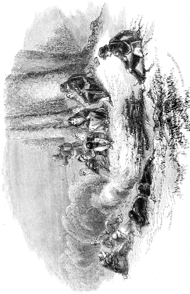
THE CAMP OF DEATH.

THE SCENES OF THE GREAT FRENCH REVOLUTION. BY J. H. STODOLSKY. LONDON, 1848.