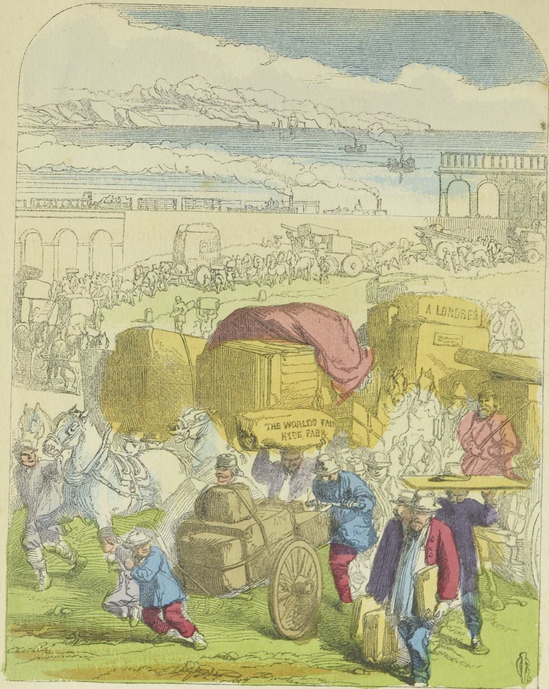
THE SHIPS, STEAMERS, AND TRAINS.