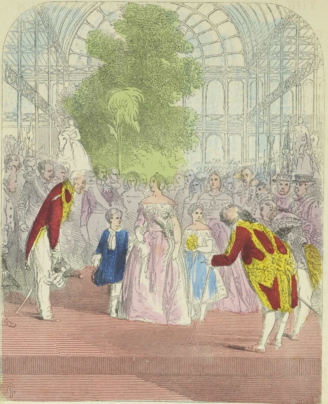
THE QUEEN AND THE ROYAL CHILDREN.