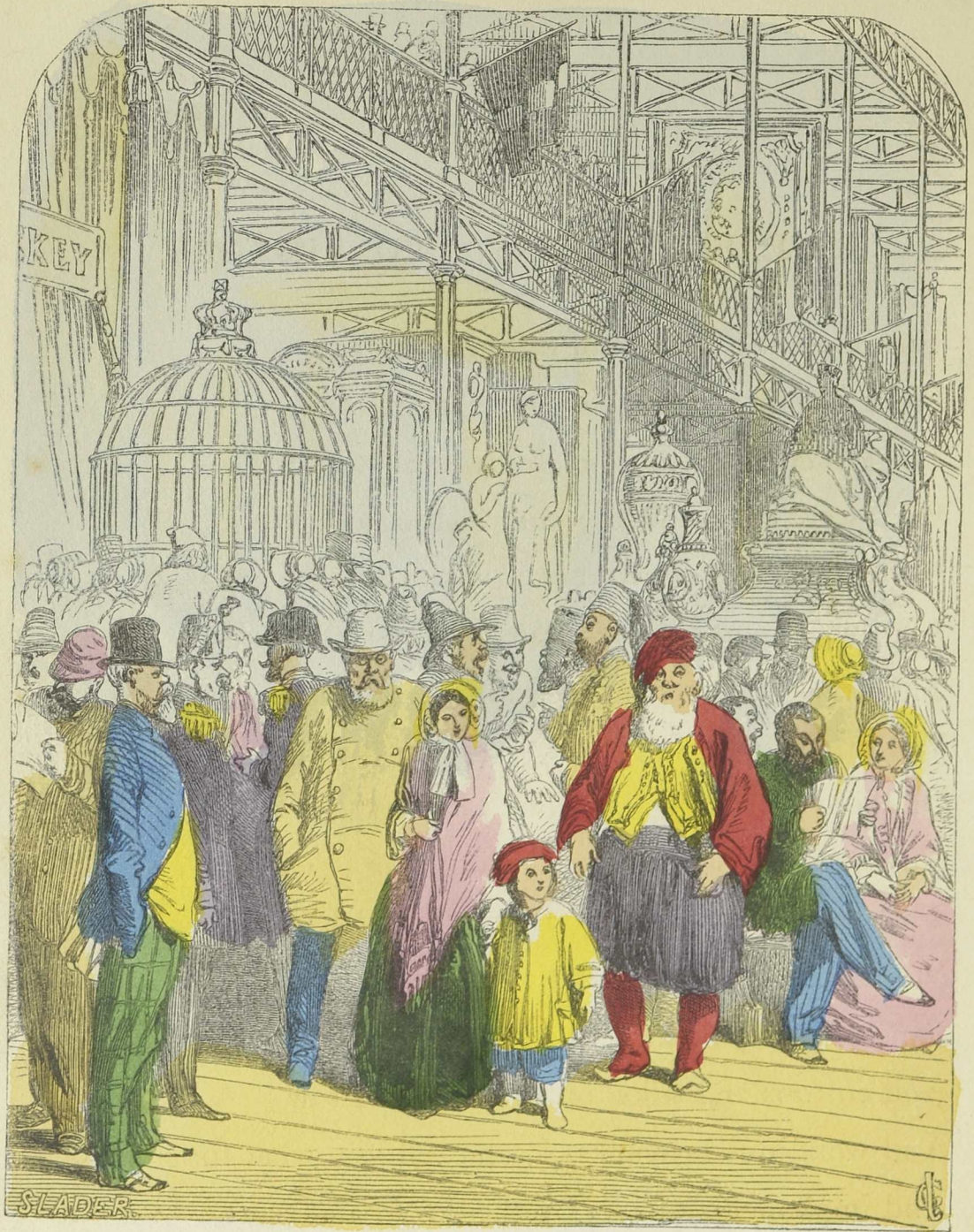
THE EXHIBITORS AND VISITORS.