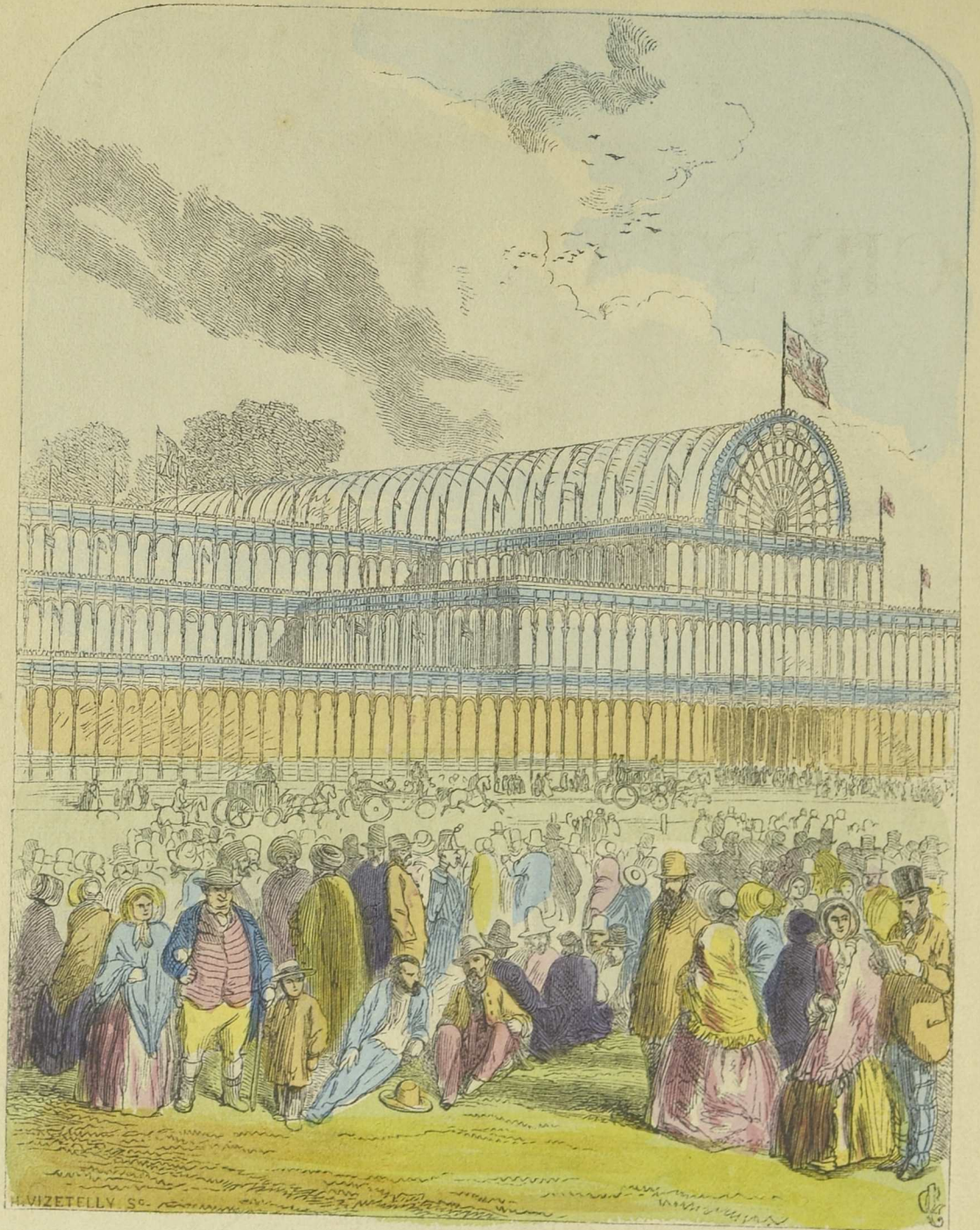
THIS IS THE PALACE THAT FOX BUILT.