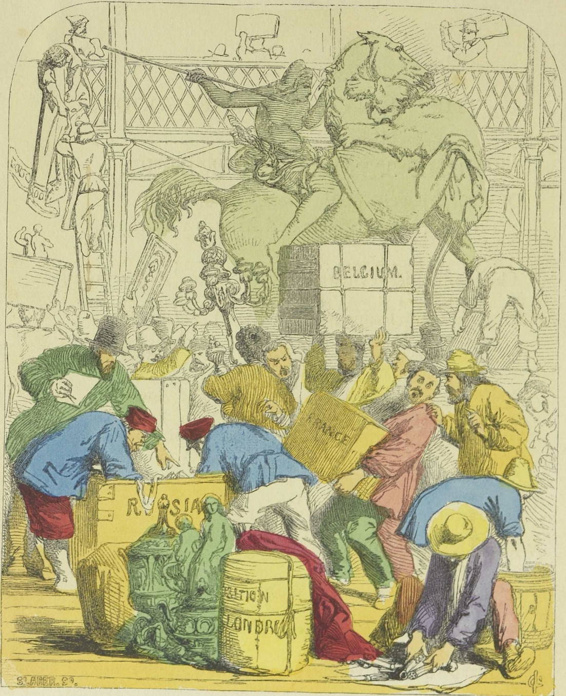
THE ARRIVAL OF THE GOODS.