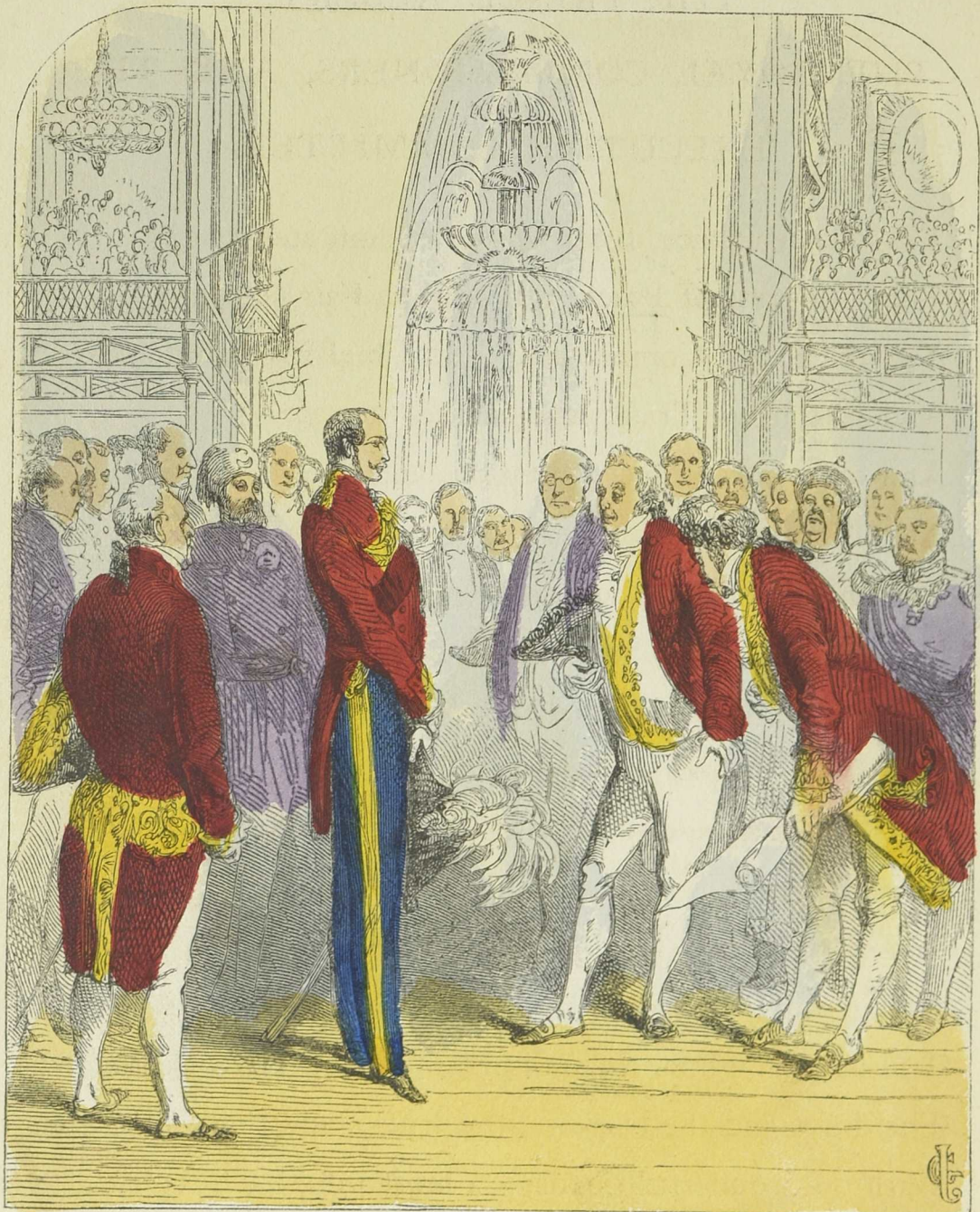
PRINCE ALBERT AND THE ROYAL COMMISSIONERS.