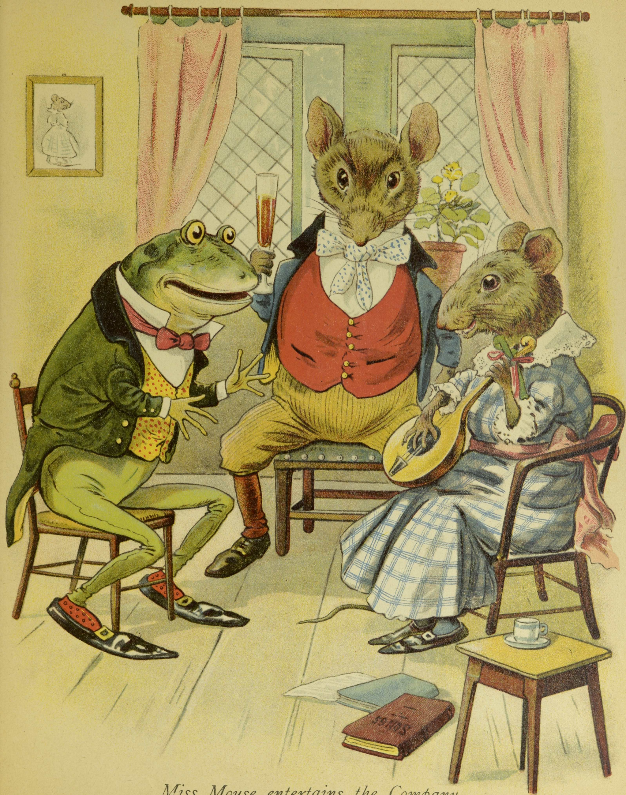
Miss Mouse entertains the Company.