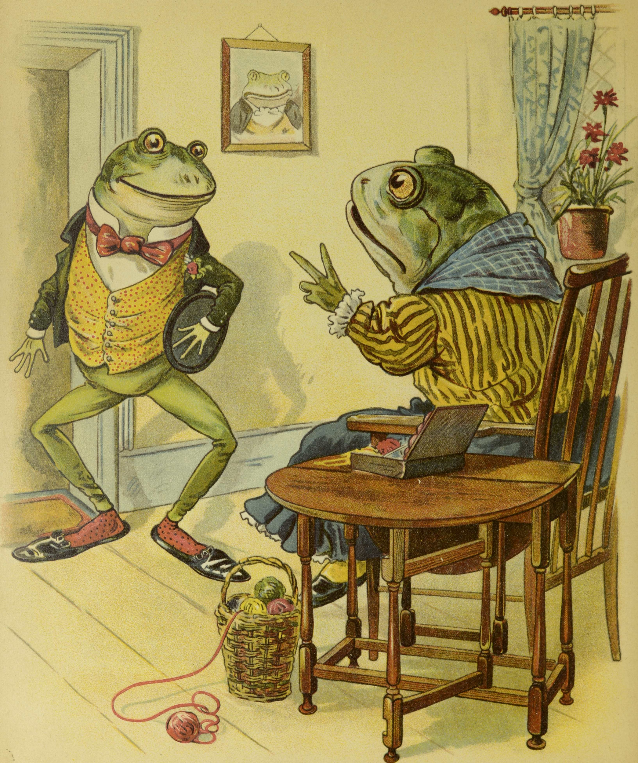
Froggy goes A-wooing.