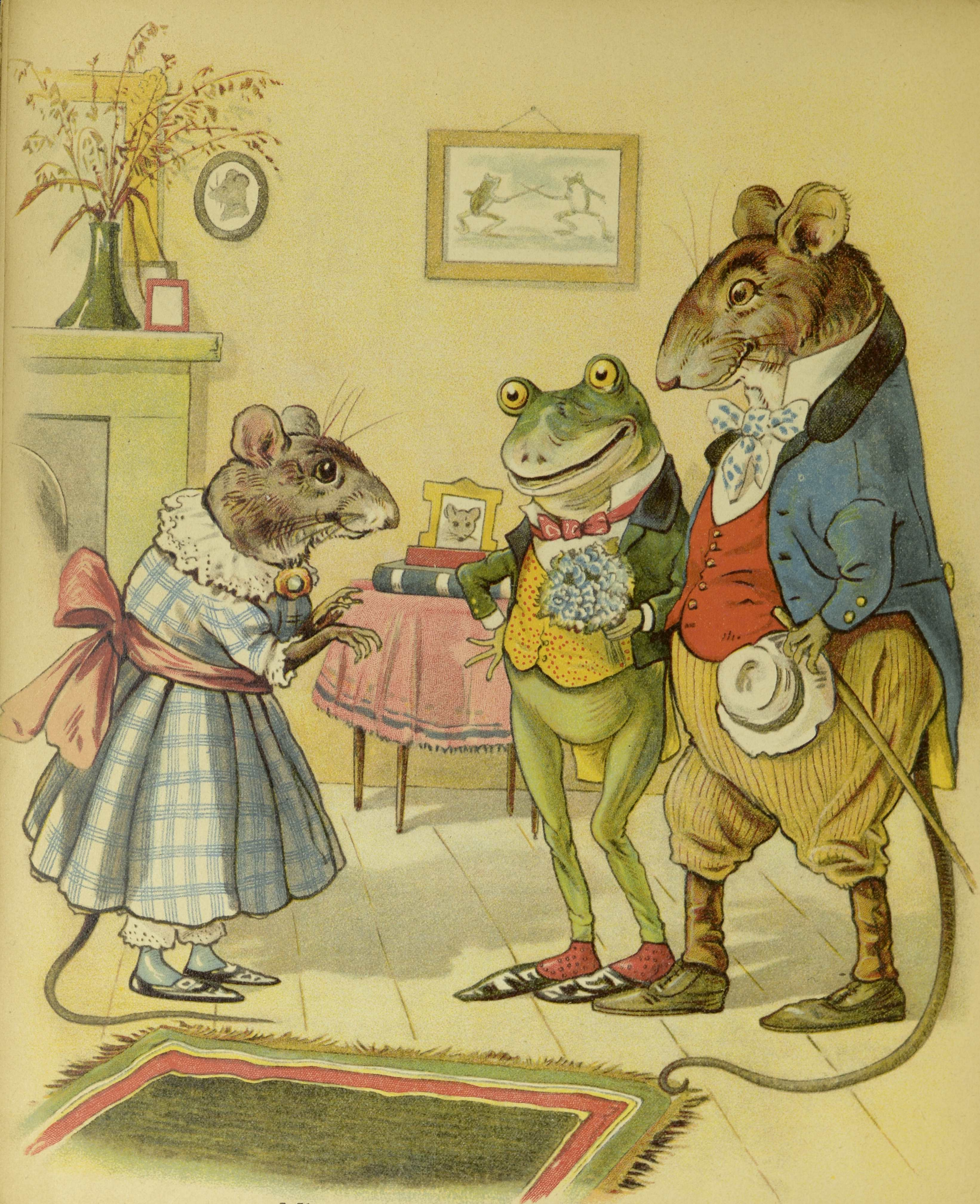
Miss Mouse welcomes her Visitors.