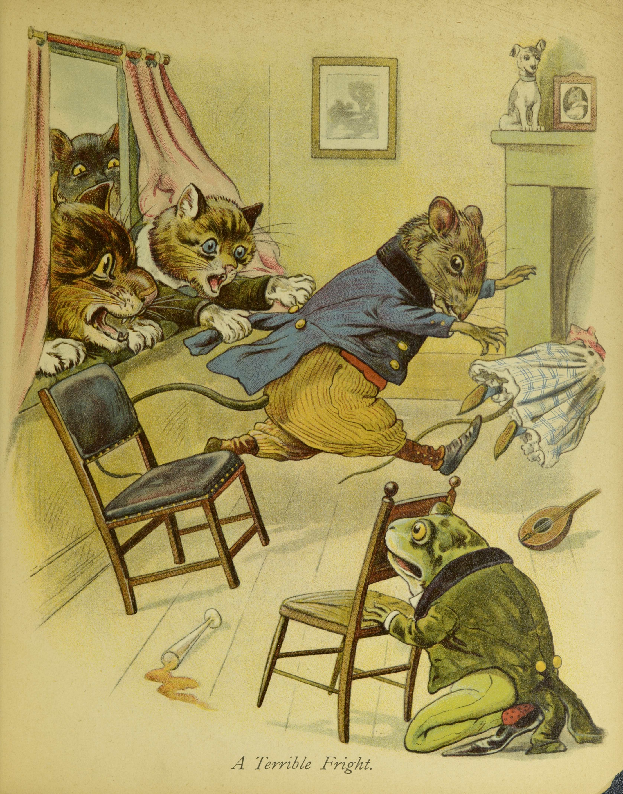
A Terrible Fright.