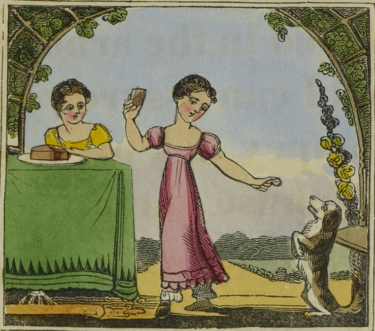
Pompey in the Arbour.