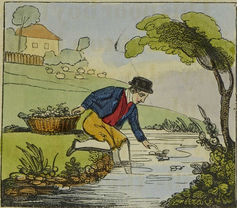
A Boy getting Water-cresses.