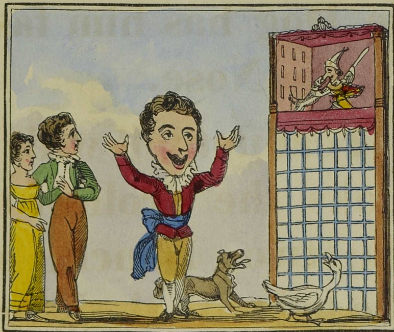
Punch amusing the Children by his droll Tricks.