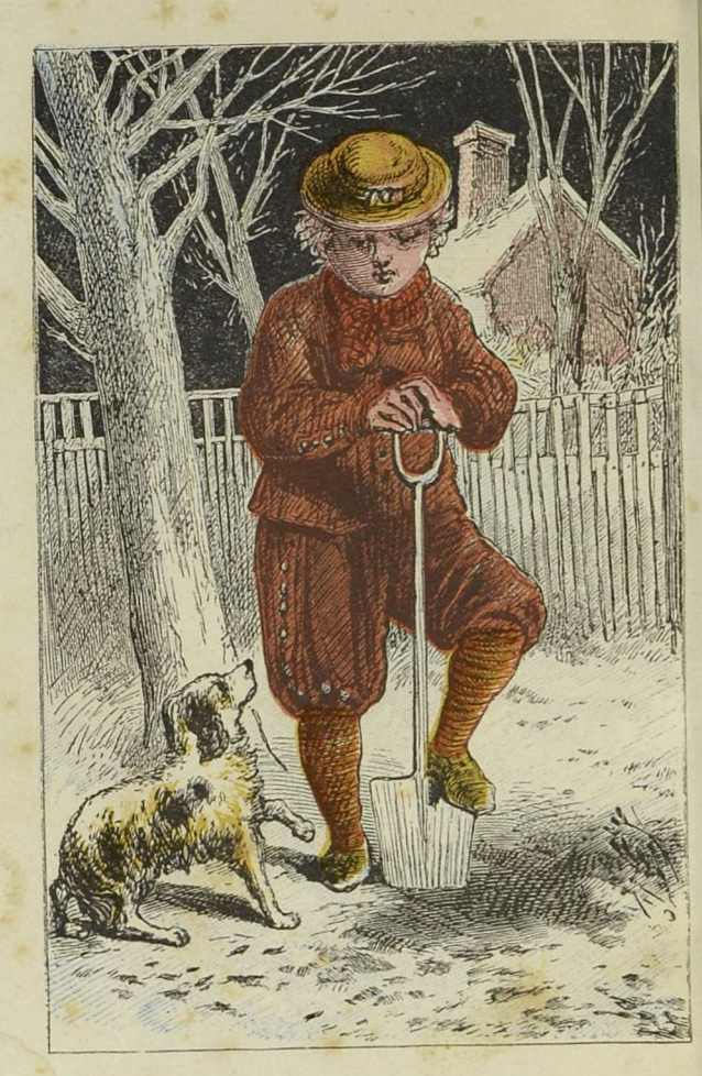
THE LITTLE BLACK HEN.