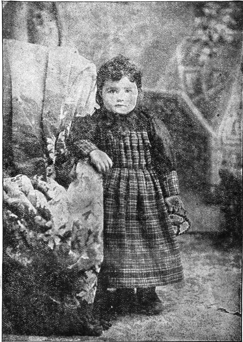
Little Miss Templeton.