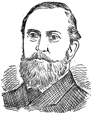
THE RIGHT HON. SIR FREDERICK ARTHUR STANLEY, GOVERNOR-GENERAL OF CANADA.

The Right Honorable Sir Frederick Arthur Stanley, Governor-General of Canada, was born 15th January, 1841. He was educated at Eton College, and afterwards held many offices of importance in England. He was appointed as Governor-General of Canada 1st May, 1888, and was sworn in on the 11th June, 1888. His administration has been an exceedingly happy one; and personally, he is very popular. His titles are: the Right Honorable Sir Frederick Arthur Stanley, Baron Stanley of Preston, in the County of Lancaster, in the Peerage of Great Britain, Knight Grand Cross of the most Honorable Order of the Bath.