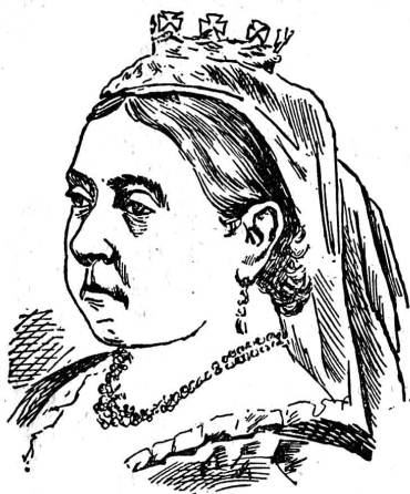
HER MAJESTY, QUEEN VICTORIA.

Her Majesty, Alexandrina Victoria, by the Grace of God, of the United Kingdom of Great Britain and Ireland, etc., Queen, Defender of the Faith, Empress of India. Her Majesty was born 24th May, 1819, succeeded to the throne 20th June, 1837; was crowned 28th June, 1838; and married 10th February, 1840. Her Majesty is the only child of his late Royal Highness, Edward, Duke of Kent, fourth son of King George III. Against the Queen, no sedition has ever risen, nor evil whisper ever breathed. Of what other monarch could so much be said? Long may she reign, is the fervent wish of her loyal subjects.