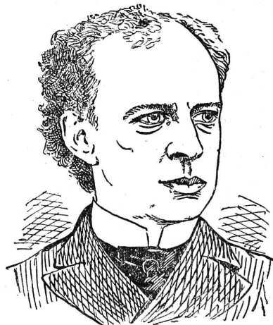
THE HONORABLE WILFRID LAURIER.