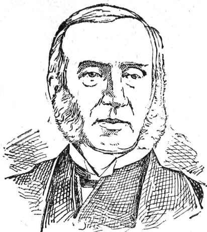
SIR ALEXANDER CAMPBELL, K.C.M.G.

Sir Alexander Campbell, K.C.M.G., Lieutenant-Governor of Ontario, was born in Yorkshire, Eng., in 1822, and received much of his early training in Lower Canada, and closed his course at Kingston, Ont. He chose law for a profession, and was called to the Bar in 1843. He was a member of the Legislative Council of Canada from 1858 to 1867, and was Speaker of that body in 1862-63. He was Receiver-General in 1878, became Postmaster-General in 1879, and Minister of Militia and Defence in 1880. In 1879 Mr. Campbell was created K.C.M.G. Since 1880 he has held various portfolios, and in 1887 was appointed Lieutenant-Governor.