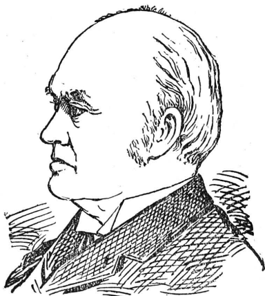
THE HONORABLE J. J. C. ABBOTT.

The Right Honorable Sir Frederick Arthur Stanley, Governor-General of Canada, was born 15th January, 1841. He was educated at Eton College, and afterwards held many offices of importance in England. He was appointed as Governor-General of Canada 1st May, 1888, and was sworn in on the 11th June, 1888. His administration has been an exceedingly happy one; and personally, he is very popular. His titles are: the Right Honorable Sir Frederick Arthur Stanley, Baron Stanley of Preston, in the County of Lancaster, in the Peerage of Great Britain, Knight Grand Cross of the most Honorable Order of the Bath.