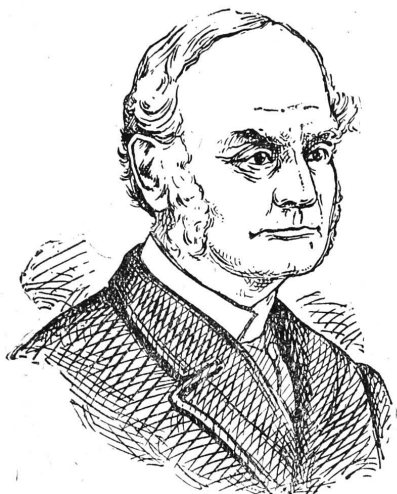
SIR SAMUEL LEONARD TILLEY.

Sir Alexander Campbell, K.C.M.G., Lieutenant-Governor of Ontario, was born in Yorkshire, Eng., in 1822, and received much of his early training in Lower Canada, and closed his course at Kingston, Ont. He chose law for a profession, and was called to the Bar in 1843. He was a member of the Legislative Council of Canada from 1858 to 1867, and was Speaker of that body in 1862-63. He was Receiver-General in 1878, became Postmaster-General in 1879, and Minister of Militia and Defence in 1880. In 1879 Mr. Campbell was created K.C.M.G. Since 1880 he has held various portfolios, and in 1887 was appointed Lieutenant-Governor.