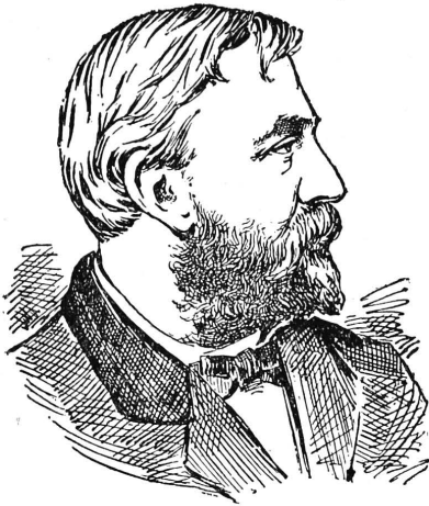
THE HONORABLE JOHN SCHULTZ

The Hon. John Schultz, Lieutenant-Governor of Manitoba, was born on the 1st January, 1840, in Amherstburg, Ont., and is of Danish blood. He was educated at Oberlin, Ohio, and graduated in medicine, after studying at Kingston and Cobourg, in 1860. That year he went to the Northwest, and identified himself with the country. He was returned to Parliament for Lisgar in 1872, and sat till 1882, when he was made a Senator, and shortly after received his present appointment.