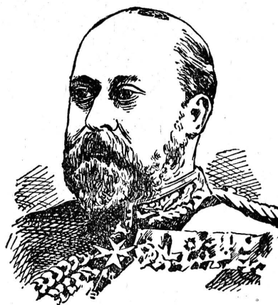
HIS ROYAL HIGHNESS, THE PRINCE OF WALES

Her Majesty, Alexandrina Victoria, by the Grace of God, of the United Kingdom of Great Britain and Ireland, etc., Queen, Defender of the Faith, Empress of India. Her Majesty was born 24th May, 1819, succeeded to the throne 20th June, 1837; was crowned 28th June, 1838; and married 10th February, 1840. Her Majesty is the only child of his late Royal Highness, Edward, Duke of Kent, fourth son of King George III. Against the Queen, no sedition has ever risen, nor evil whisper ever breathed. Of what other monarch could so much be said? Long may she reign, is the fervent wish of her loyal subjects.