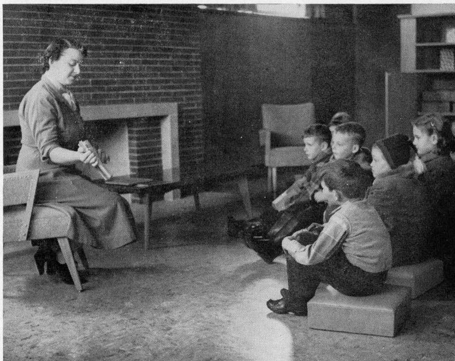
Story hour in new main library