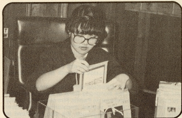
Checking out the wide selection of popular and educational videos at the S. Walter Stewart Branch.

A major improvement in accessing the variety of materials in the East York Public Library System was undertaken this year - new cassettes and compact discs were added to the database. The online catalogue now contains our book, video, cassette and compact disc holdings. In addition, major improvements were made in cataloguing and book ordering procedures, resulting in a much faster turnaround time for all library materials.