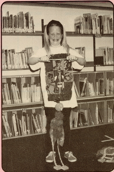
Thorncliffe crafter is as proud as a peacock of her marionette puppet!