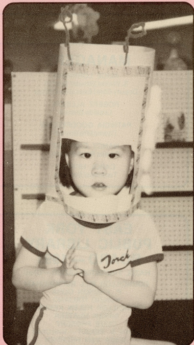
A junior astronaut models her original space helmet!

Other '91 highlights include the Metro-wide "Illustrator in Residence" programme, and the publication of new booklists for children "Pirates: Prose and Poetry", and "Light Reading".