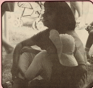
Mum and daughter duo enjoy the show at Canada Day '91.