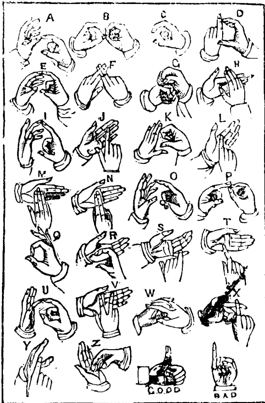
DUMB DOUBLE-HANDED ALPHABET