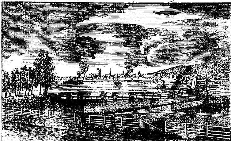
VIEW OF MONTREAL.