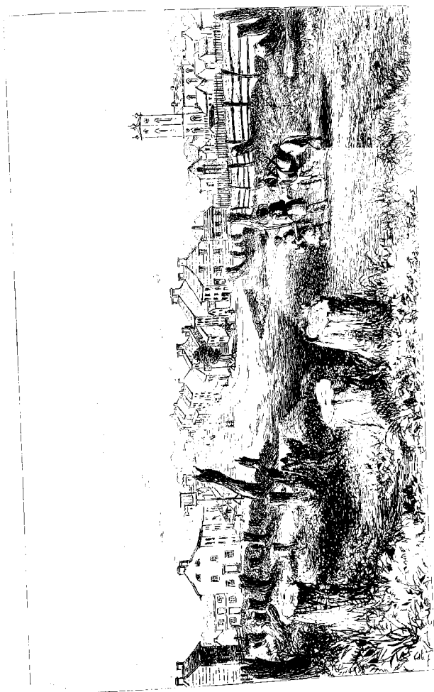
LONDON CANAL WAST