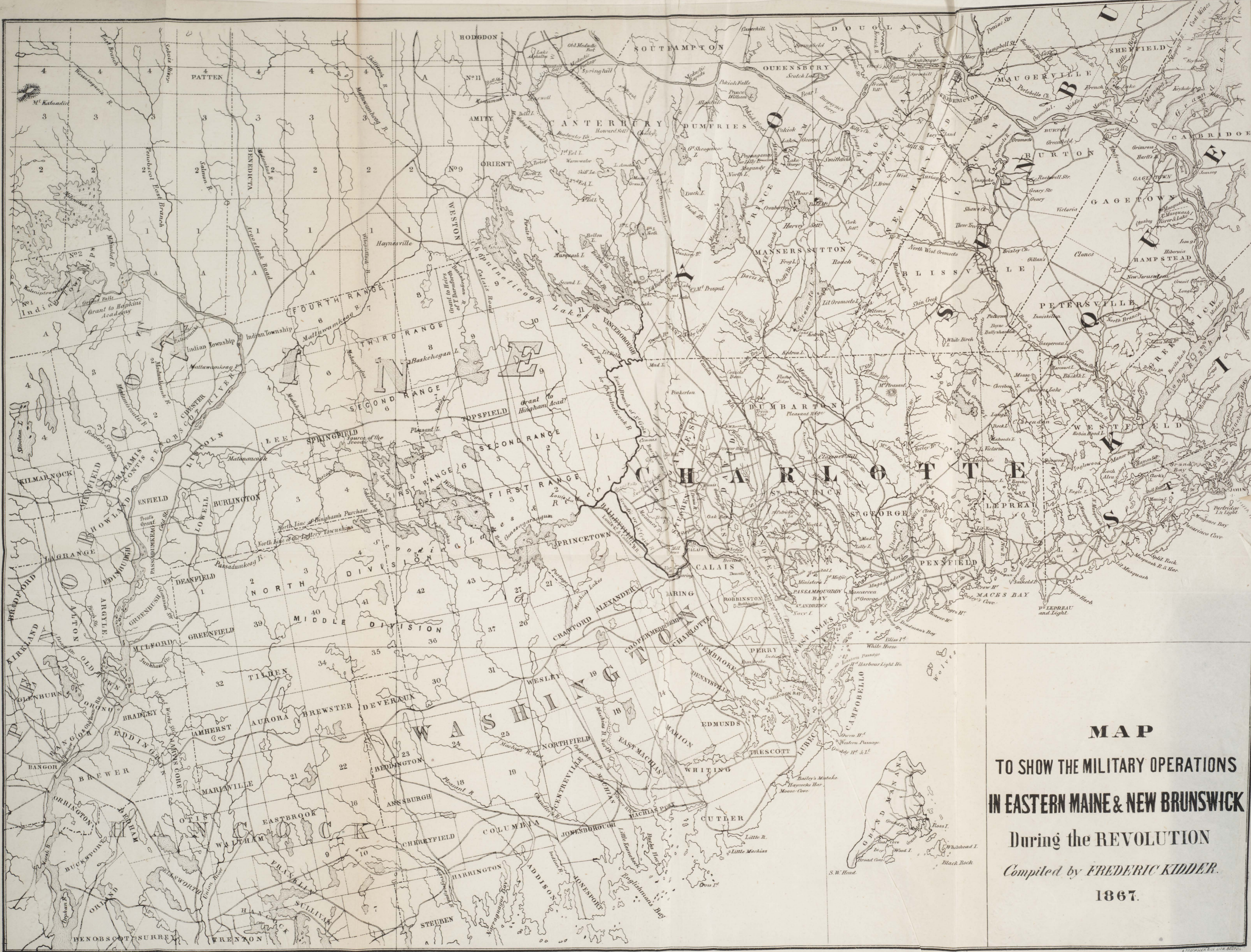
MAP TO SHOW THE MILITARY OPERATIONS IN EASTERN MAINE & NEW BRUNSWICK During the REVOLUTION Compiled by FREDERIC KIDDER. 1867.