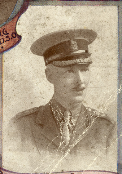
BRIG. GEN. E.C. ASHTON G.O.C. 15 th Can. Inf. Brigade

ARRANGED BY THE 5 TH CANADIAN DIVISIONAL ATHLETIC ASSOCIATION 5 TH