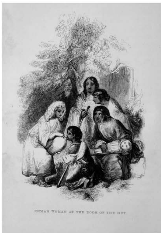
INDIAN WOMAN AT THE DOOR OF THE HUT