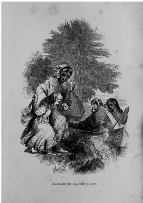
CATHARINE CARRIED OFF.