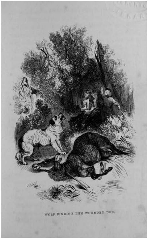
WOLF FINDING THE WOUNDED DOR.