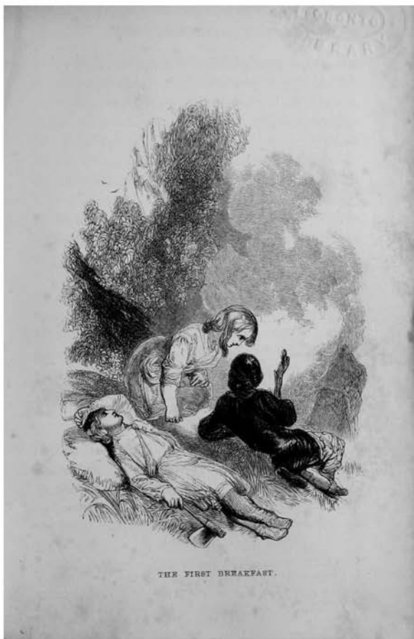
THE FIRST BREAKFAST.