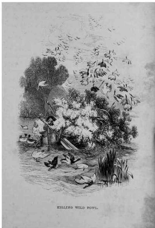
KILLING WILD FOWL.