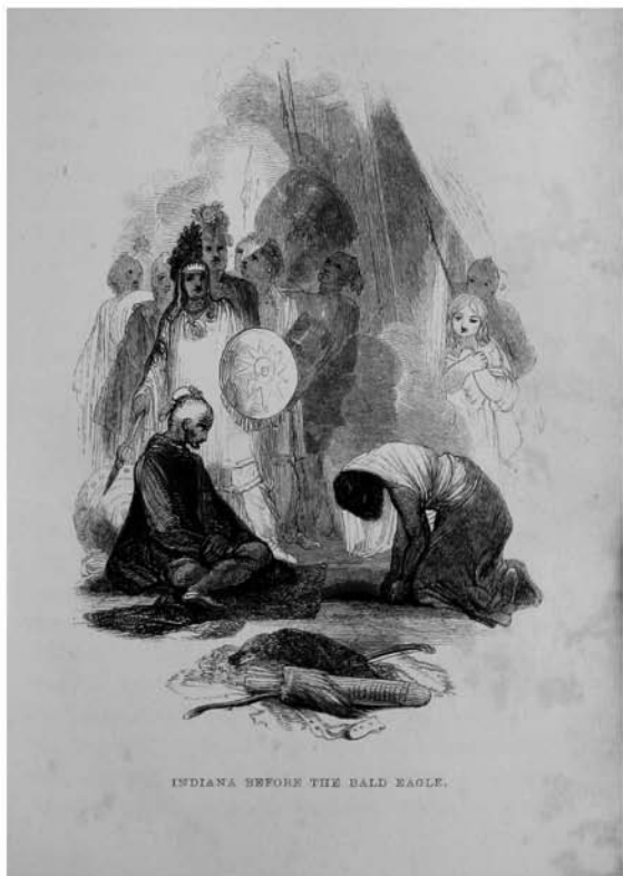
INDIANA BEFORE THE BALD EAGLE.