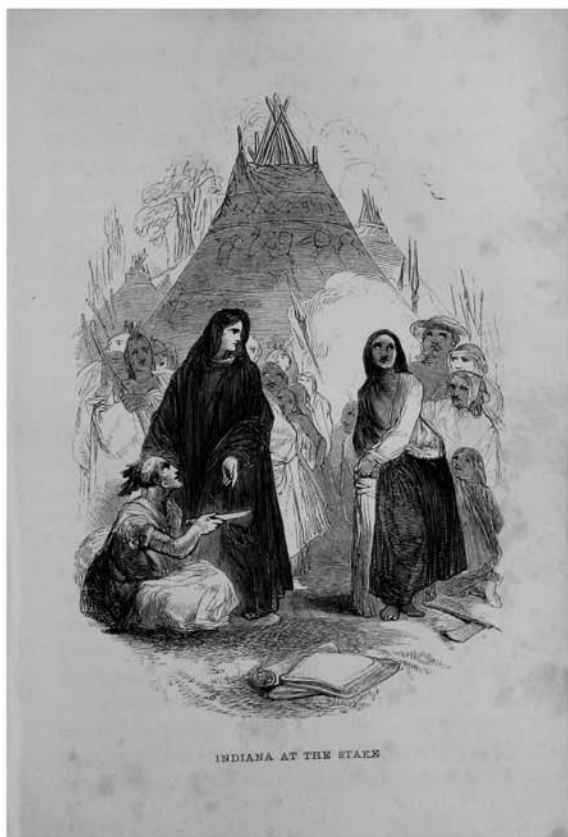
INDIANA AT THE STAKE