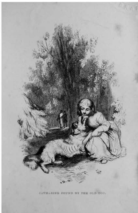
CATHERINE FOUND BY THE OLD DOG.