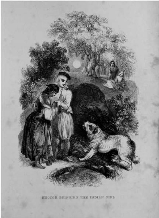
HECTOR BRINGING THE INDIAN GIRL