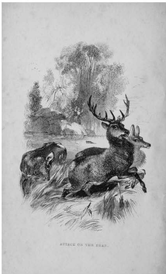
ATTACK ON THE DEER.