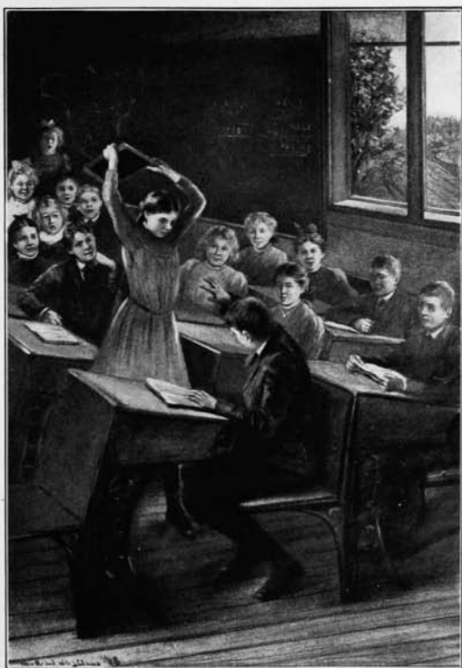
"THWACK! ANNE HAD BROUGHT HER SLATE DOWN ON GILBERT'S HEAD."