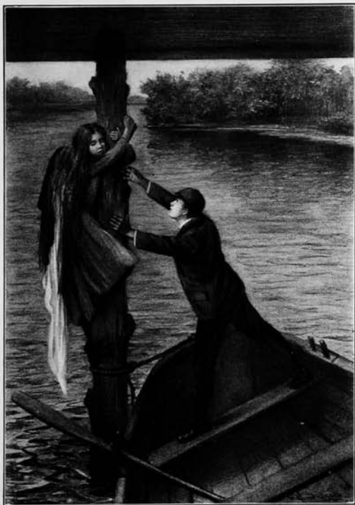
"HE PULLED CLOSE TO THE PILE AND EXTENDED HIS HAND."