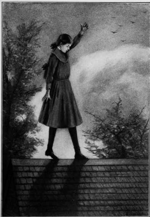
"BALANCED HERSELF UPRIGHTLY ON THAT PRECARIOUS FOOTING."