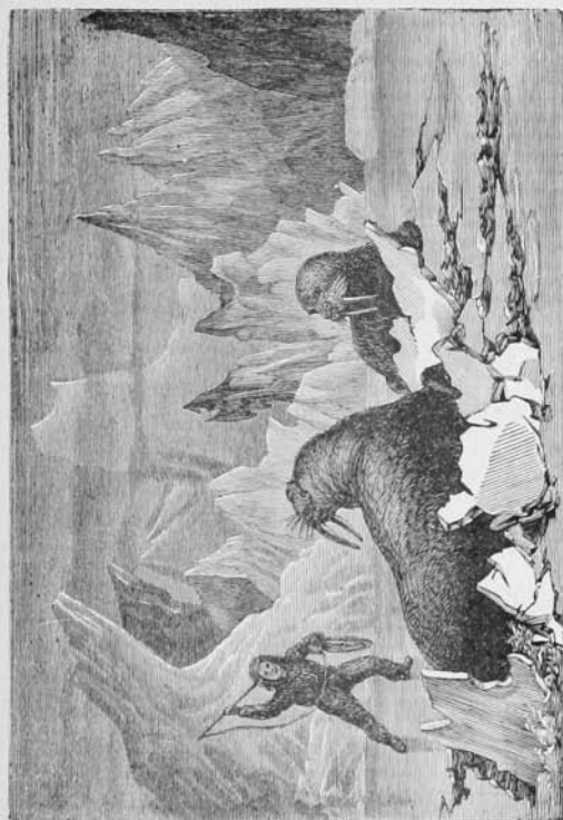
THE WALRUS HUNT.