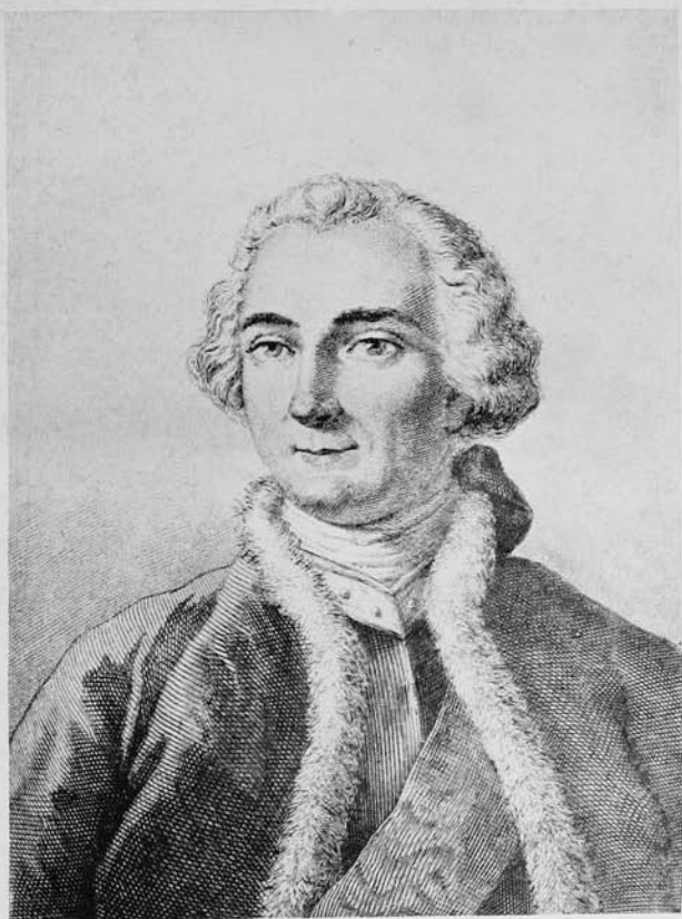
MARQUIS OF MONTCALM.