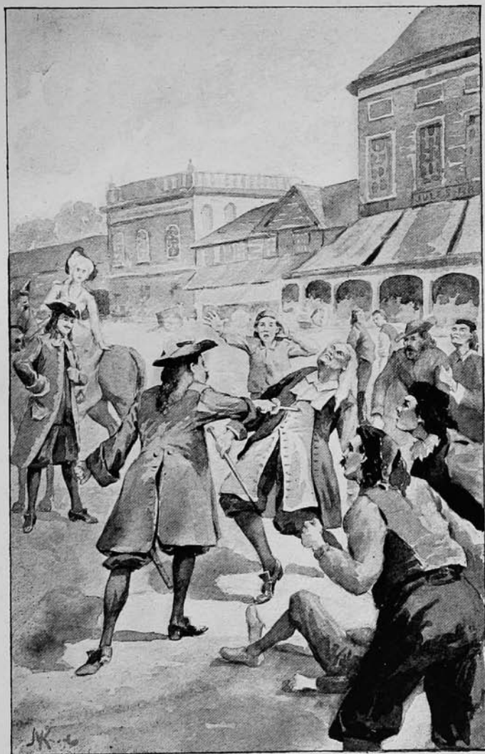
DEATH OF THE BOURGEOIS.