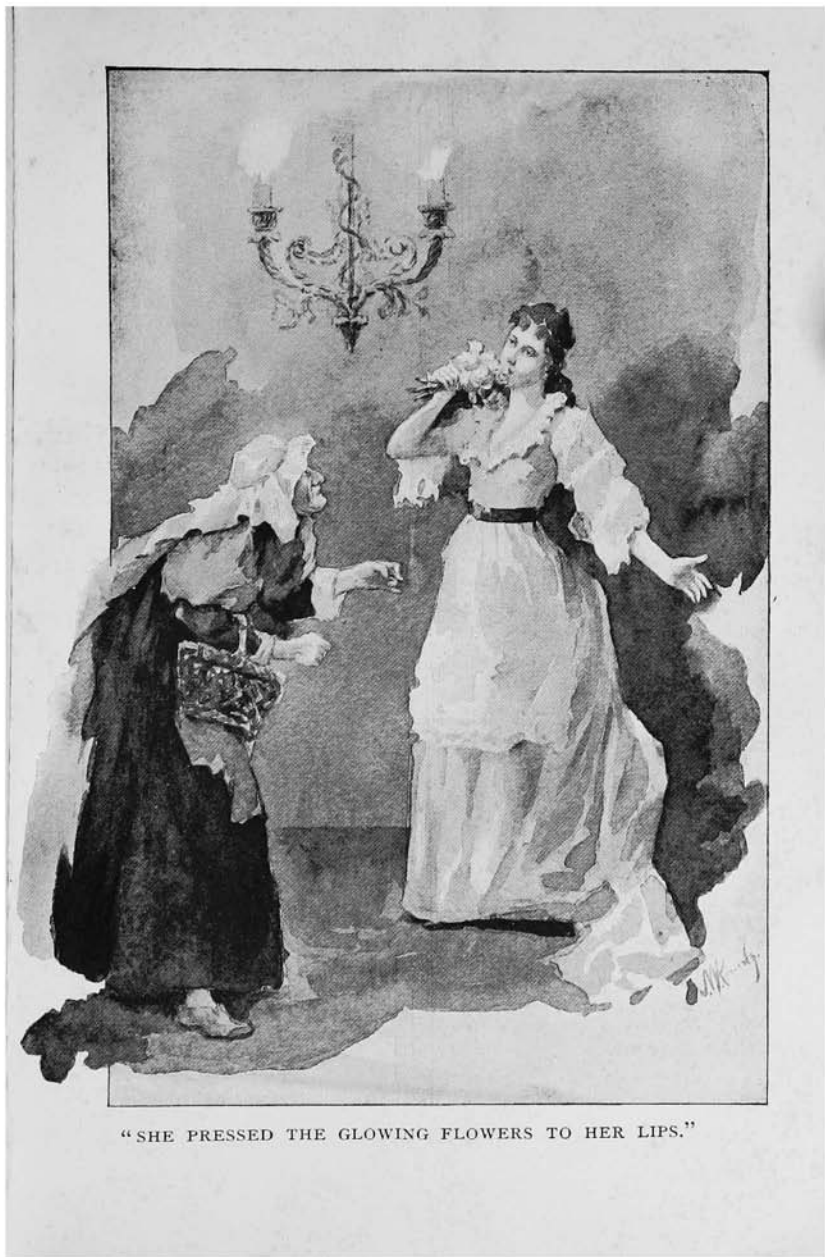
"SHE PRESSED THE GLOWING FLOWERS TO HER LIPS."