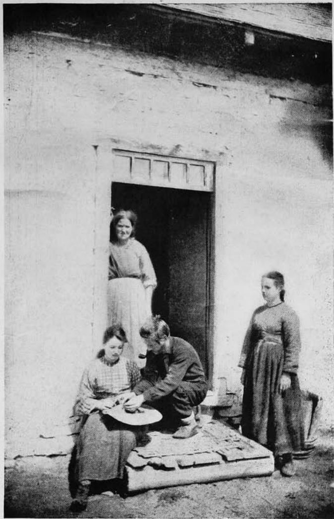
A GROUP OF HABITANS.