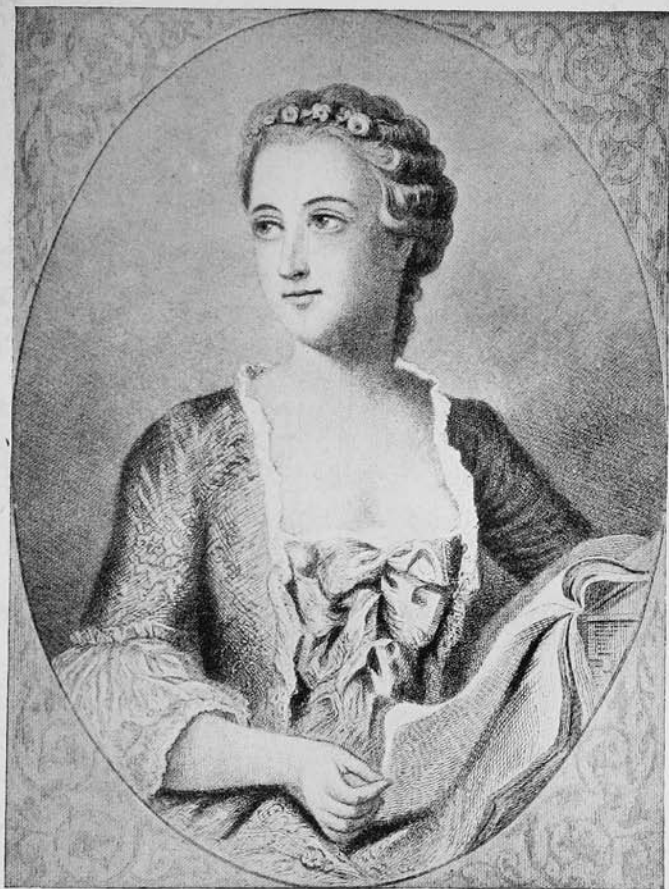
MARQUISE DE POMPADOUR.