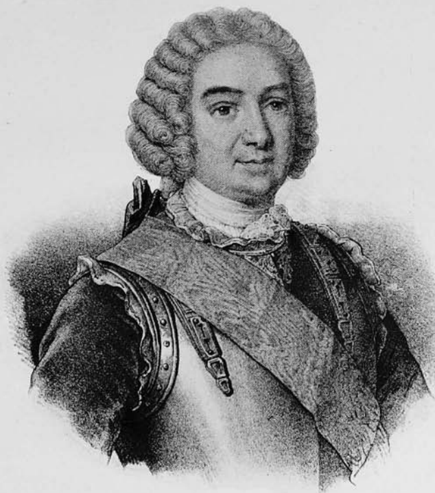
COUNT DE LA GALISSONIERE.