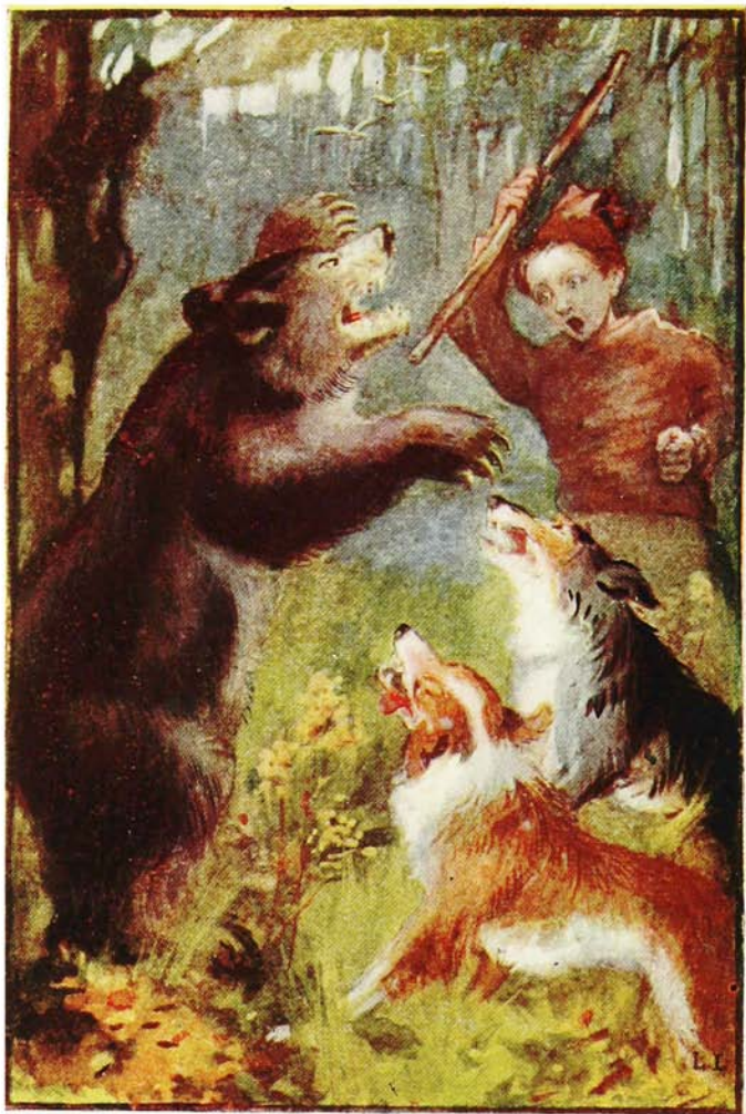
A BIG BLACK BEAR MADE FURIOUS EFFORTS TO SEIZE DOUR AND DANDY. [See page 19.