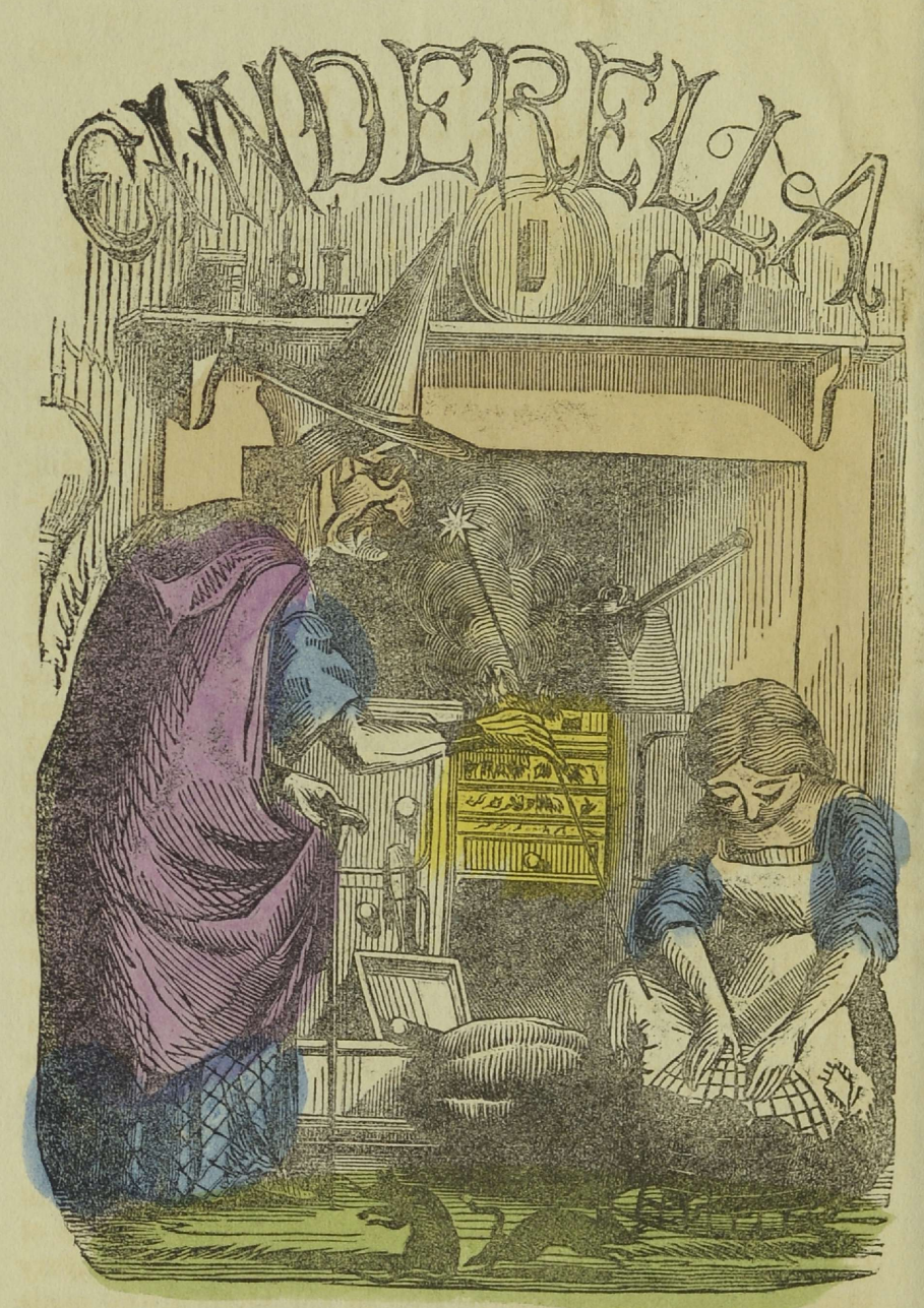
CINDERELLA PREPARING FOR THE BALL.