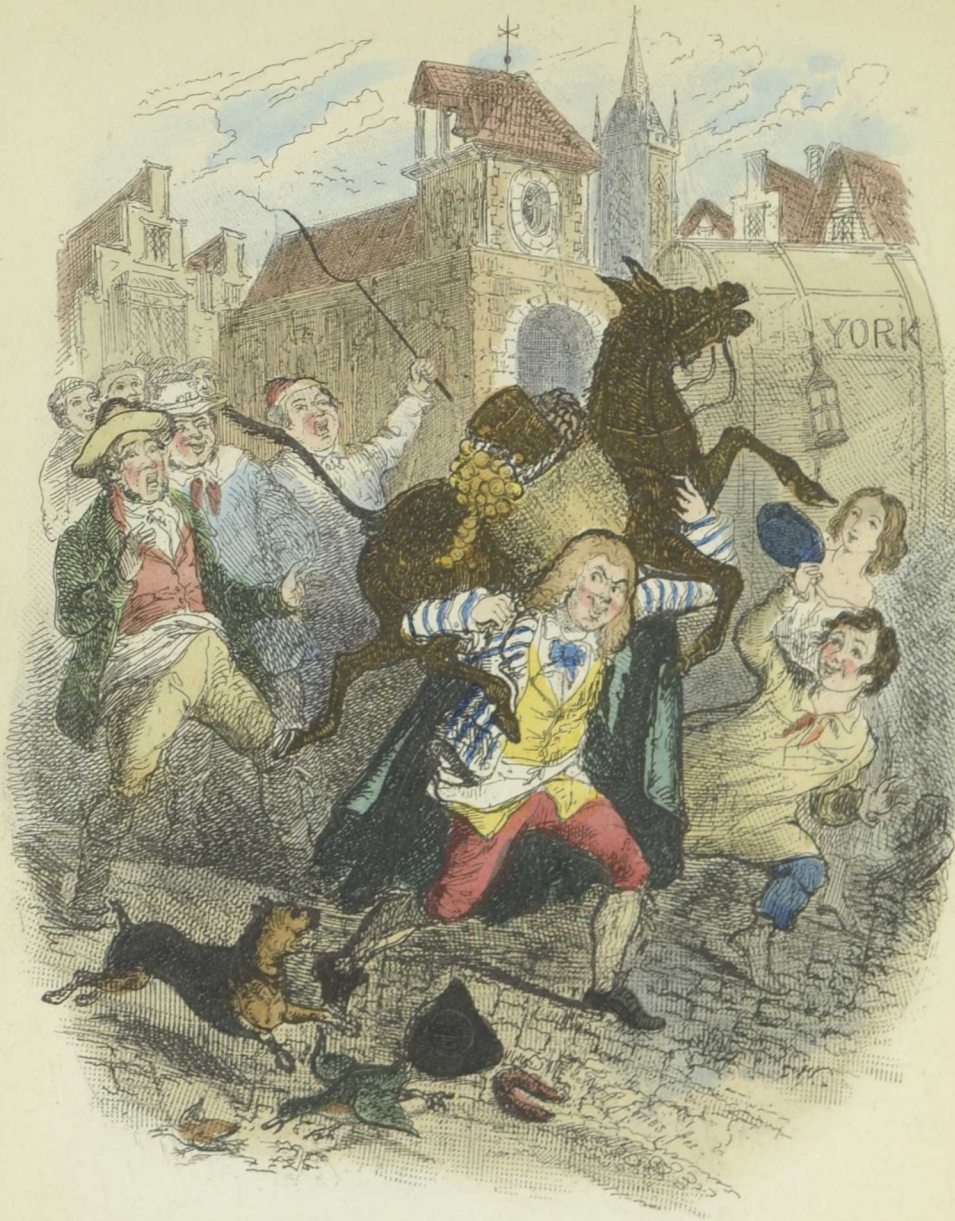
THE BARBER AND HIS CUSTOMER.