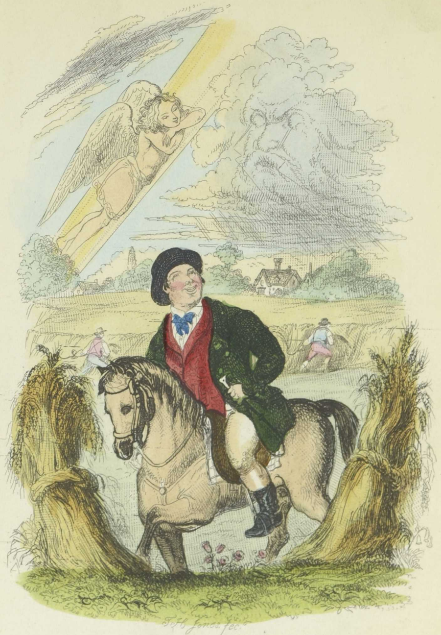
THE CLOUD AND THE SUNBEAM.