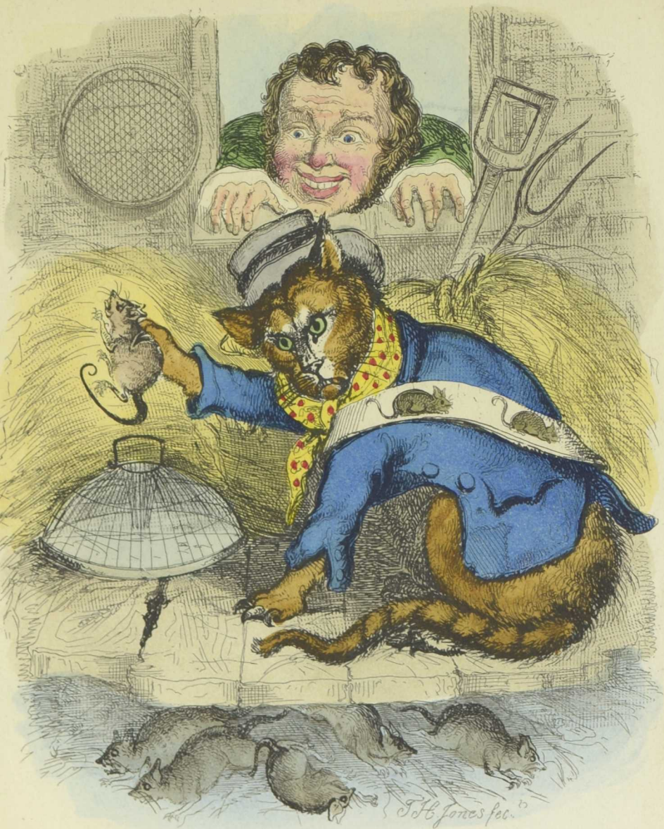
THE DISOBEDIENT MOUSE.