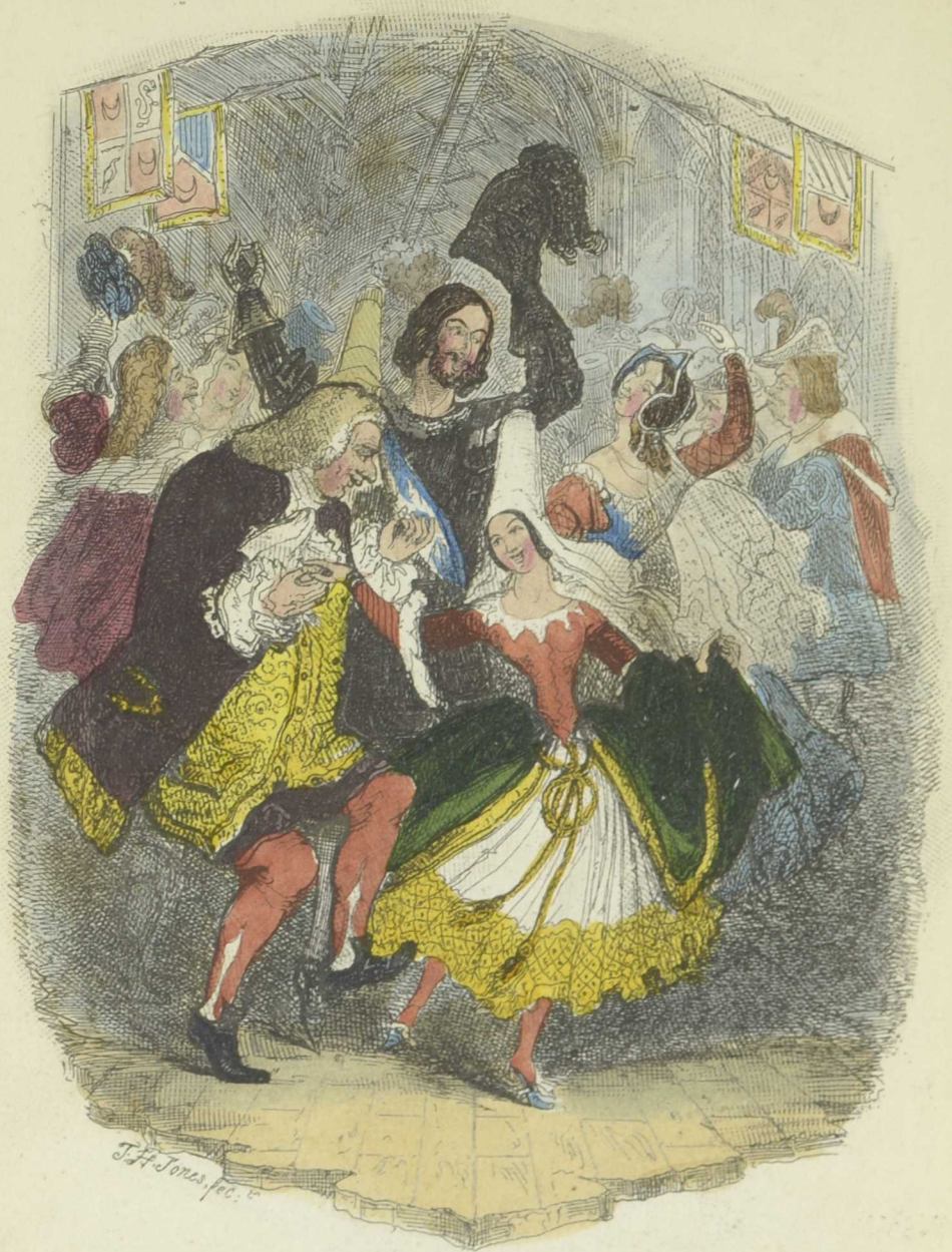
HOW SIR ROGER SPENT CHRISTMAS.