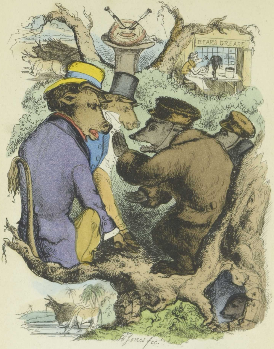
THE BEARS AND THE BUFFALOES.