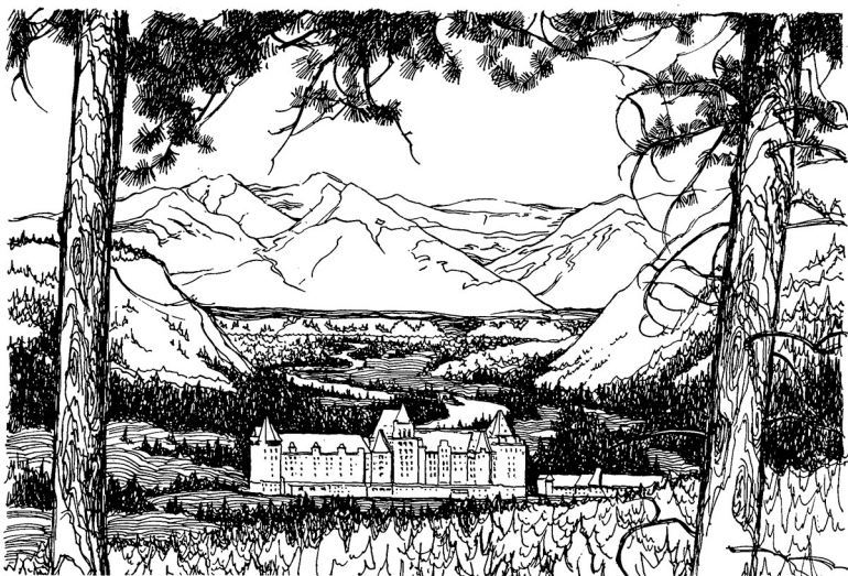
Banff Springs Hotel, Canadian Rockies