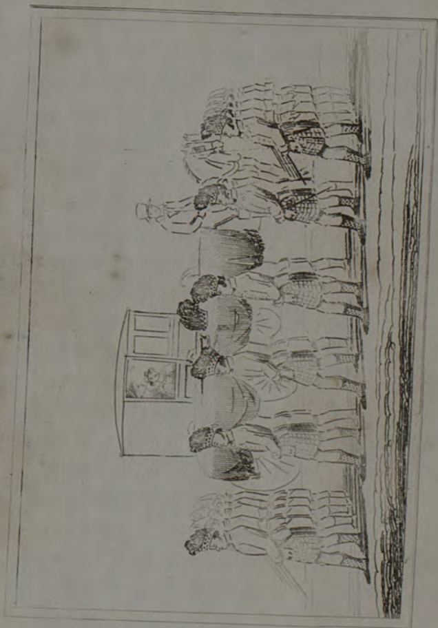
It was an Officer's Funeral.