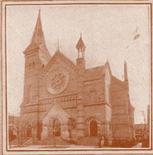
Alice St. Church